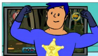
SID the Superhero